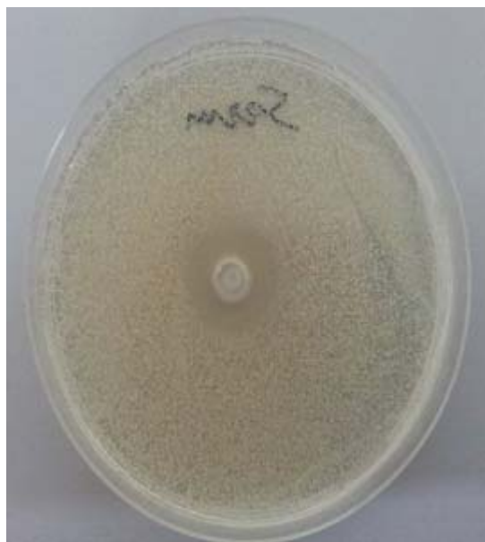
Figure 2. Inhibition zone obtained by 20 \mu l of oil deposited in the presence of MRSA